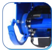
HEAVY DUTY BODY STRUCTURE WITH 7 MM THICK BLADE