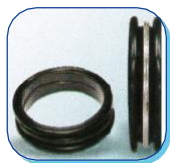
DUO CONE MECHANICAL SEAL SUITABLE FOR DRY & WET LANDS