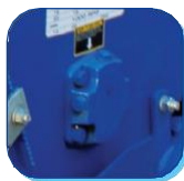
OIL IMMERSSED SIDE BEARINGS