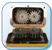
HEAVY DUTY 2 SPEED GEARBOX