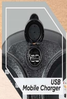
USB Mobile Charger